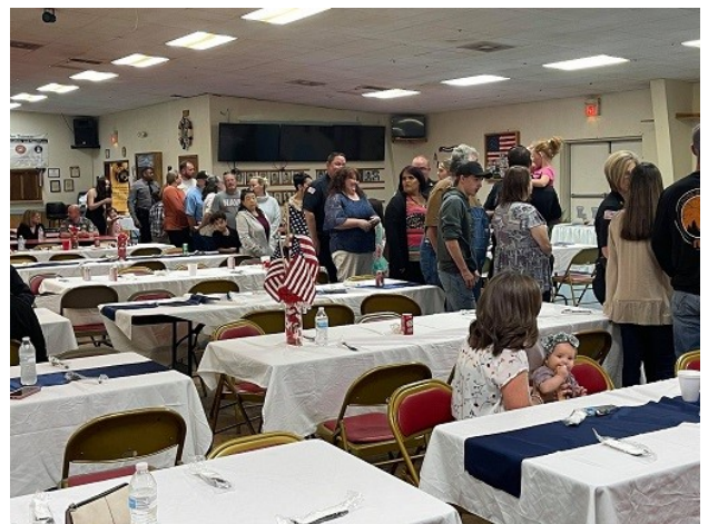
Food is served