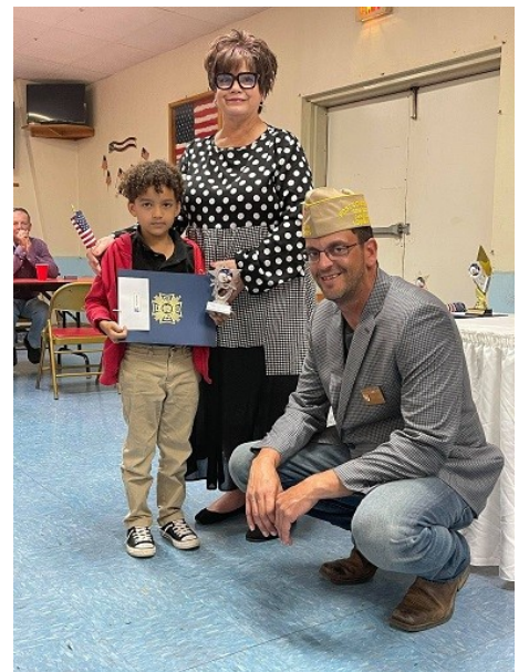
Our Amazing Youth!