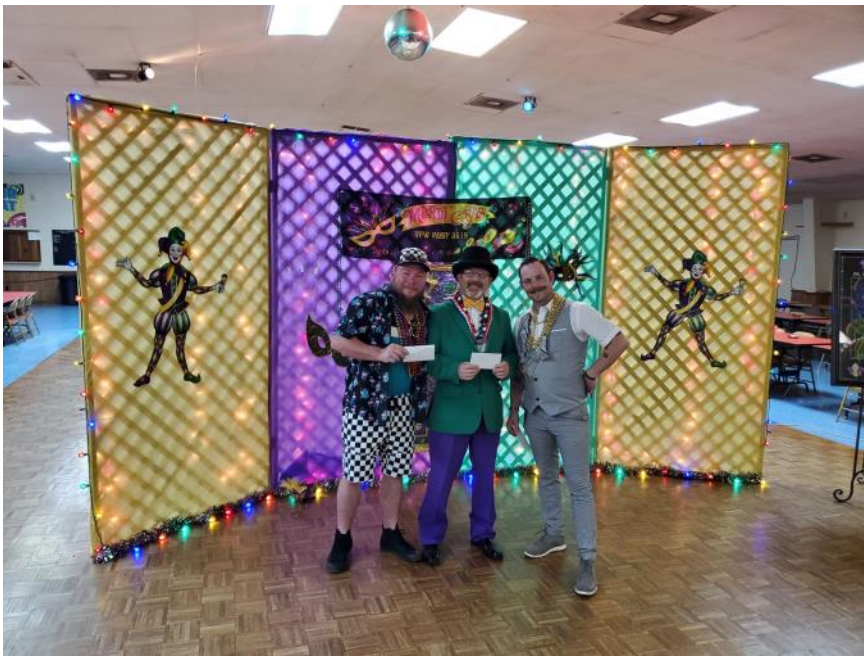
Our top 3 Men showing off their prize money!