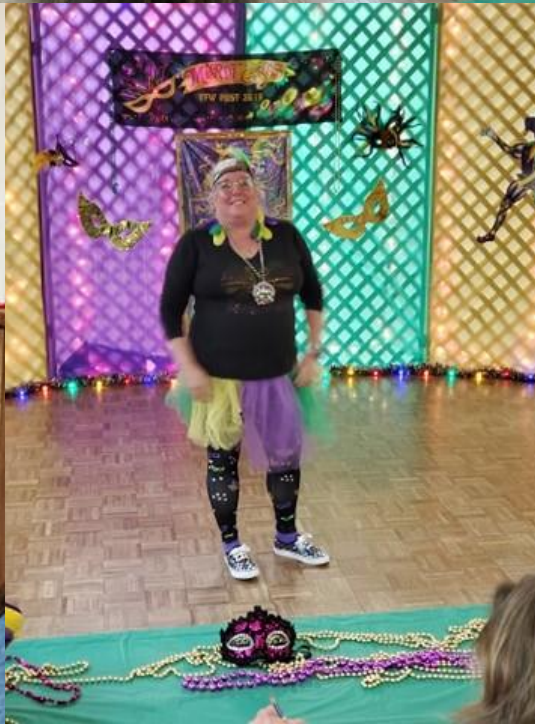
Our beautiful ladies compete for the top prizes in the Mardi Gras Best Dressed Contest