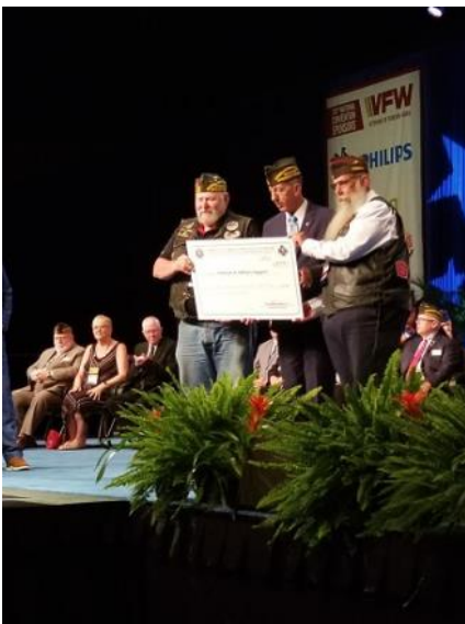
$33,000 Check Presented on behalf of the VFW Riders to NVMS