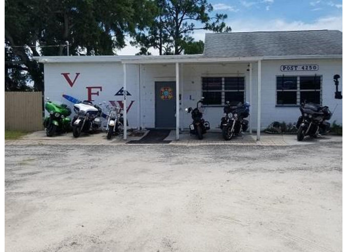
2nd Stop Post 4250 New Smyrna, FL