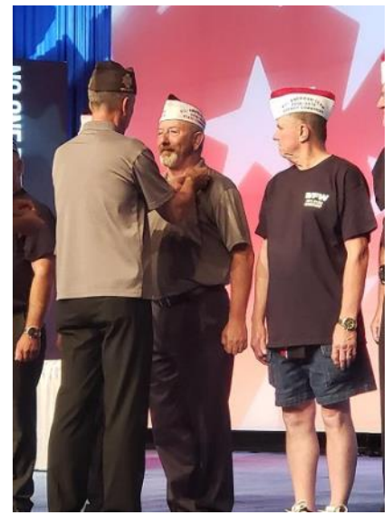
State Commander Awarded "Triple Crown", for achieving All American Post, District and Department Commander