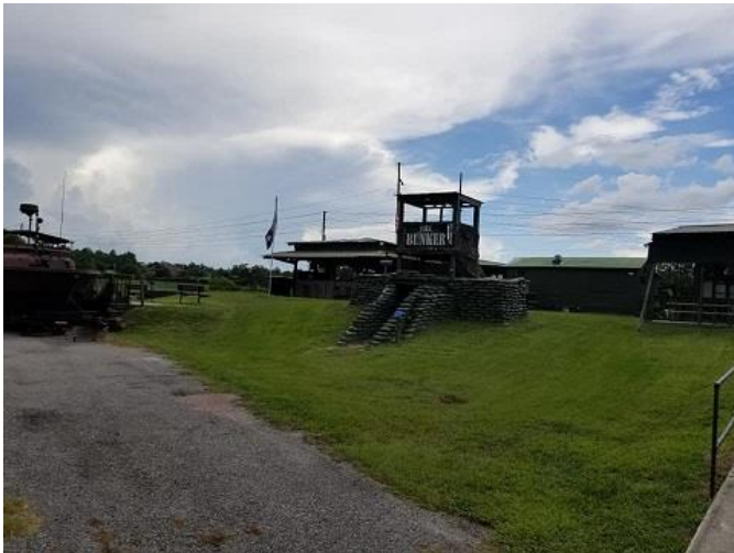
3rd Stop The Bunker