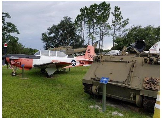
3rd Stop The Bunker