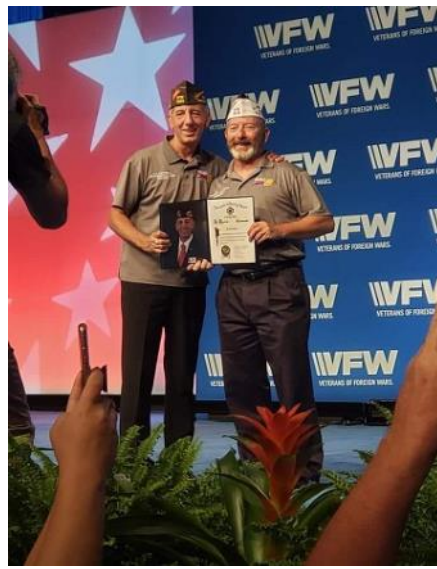
State Commander awarded All American Department Commander