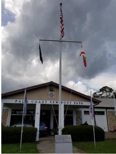
1st Stop Post 8696 Palm Coast, FL