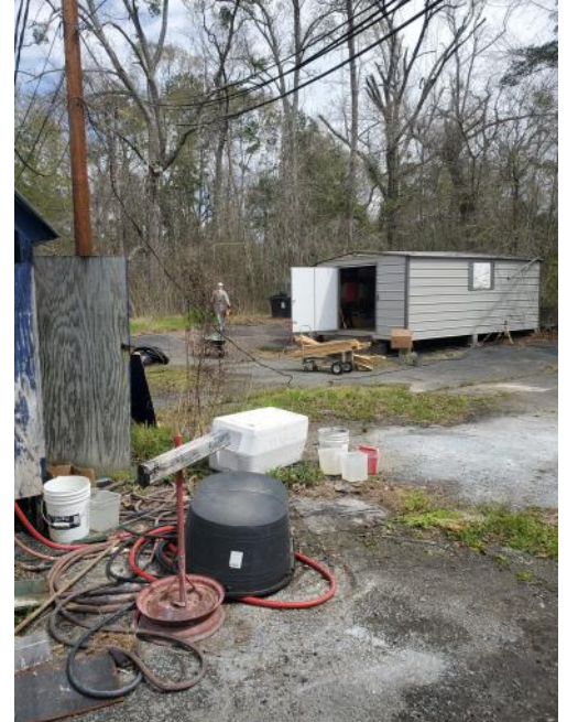
Cleaning the Sheds