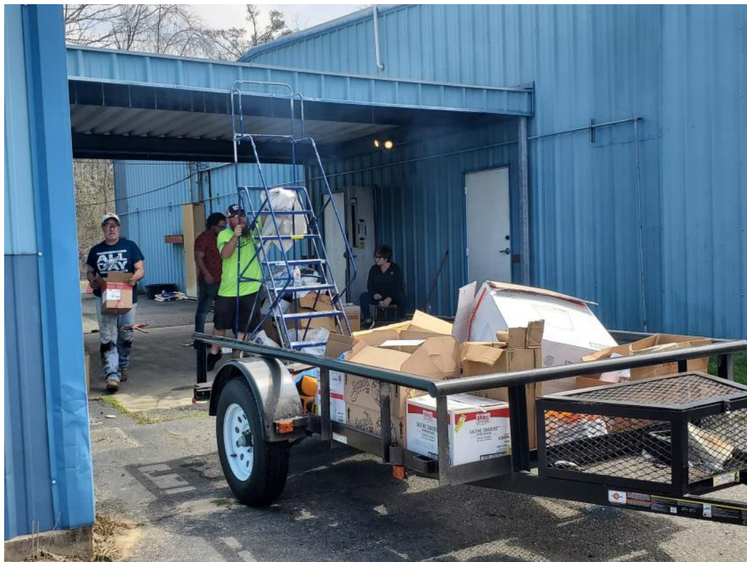
Throwing away old items