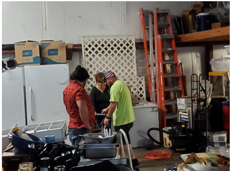
Cleaning the Storage Building