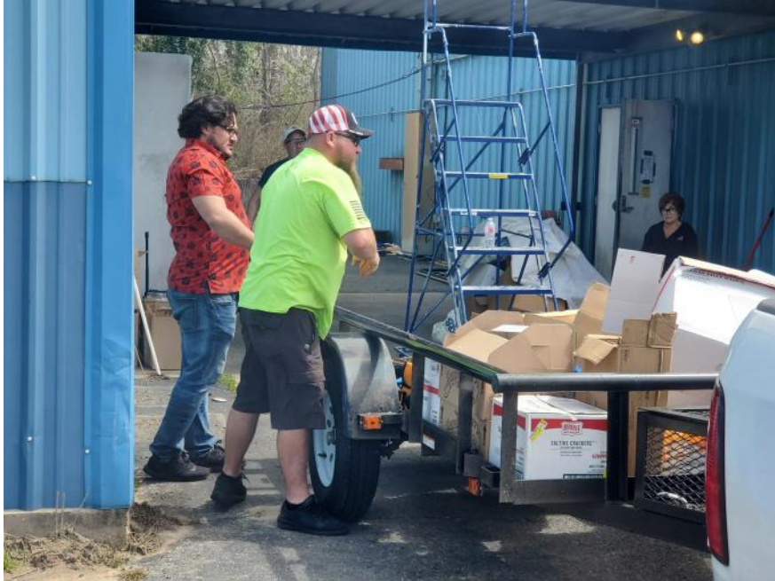
Throwing away old items