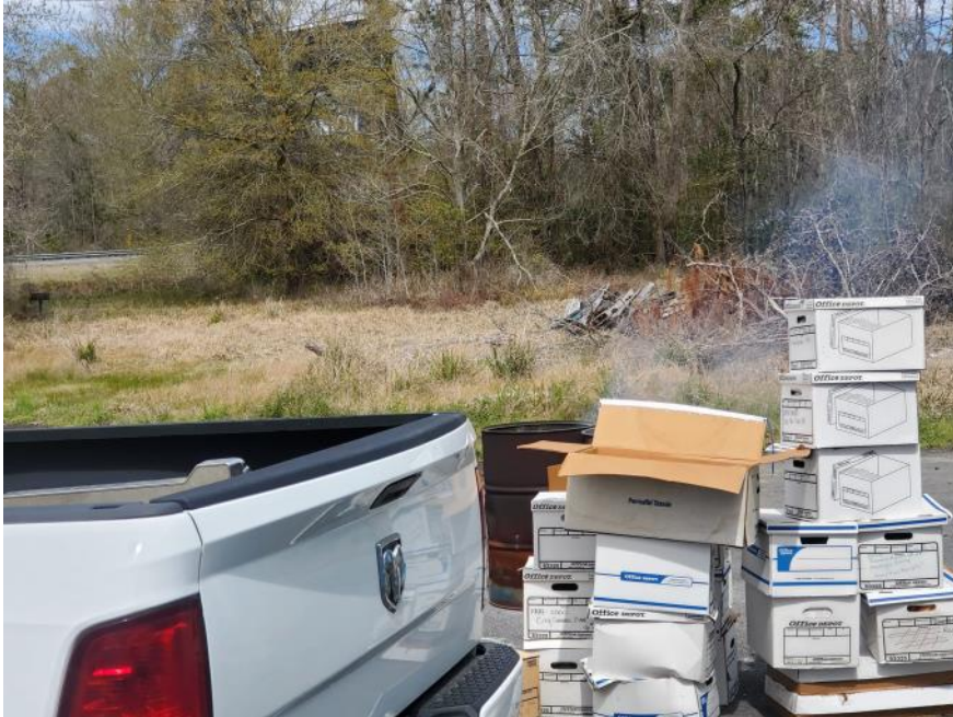
Burning and throwing away old items