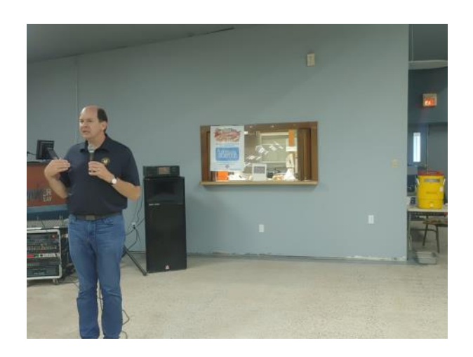
State Senator Mike Reese