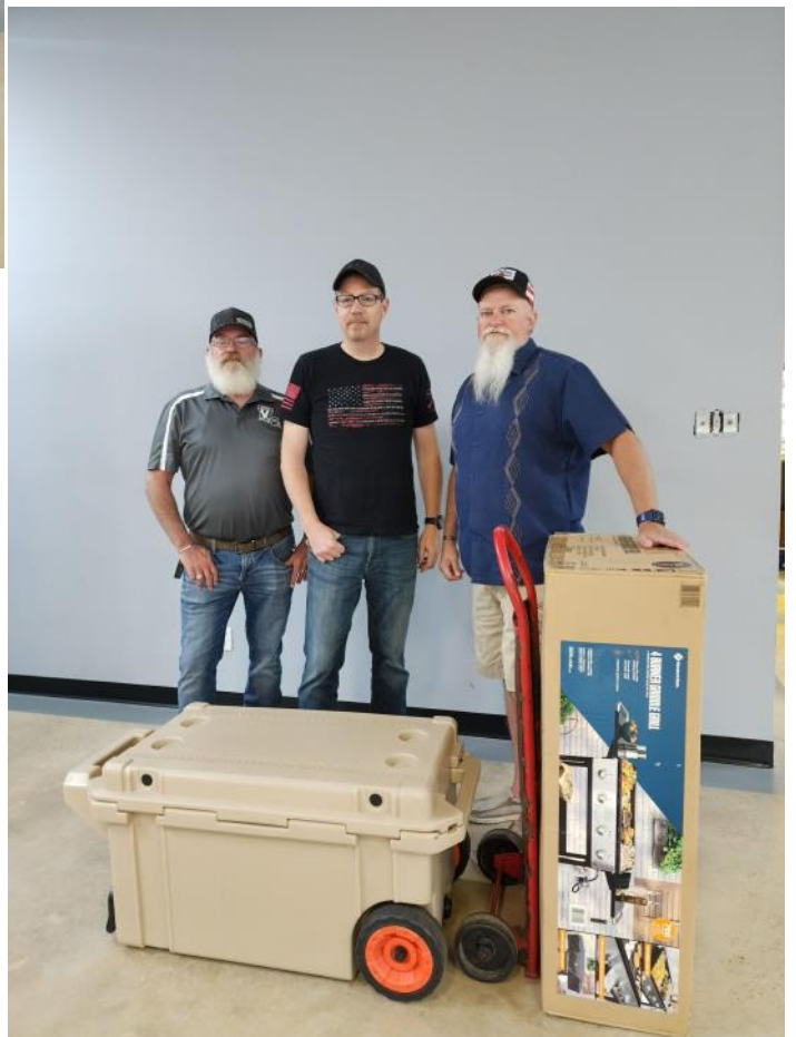
Second Place: Pelican Elite 80 Quart Cooler and 4-Burner Blackstone