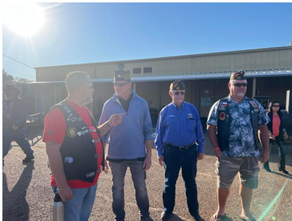
State Commander's from Arkansas, Oklahoma, Louisiana and Texas