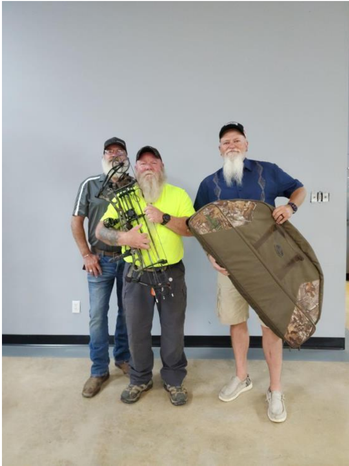
First Place: Savage 110 TAC 6.5 Creedmoor Rifle, and Bear Compound Bow