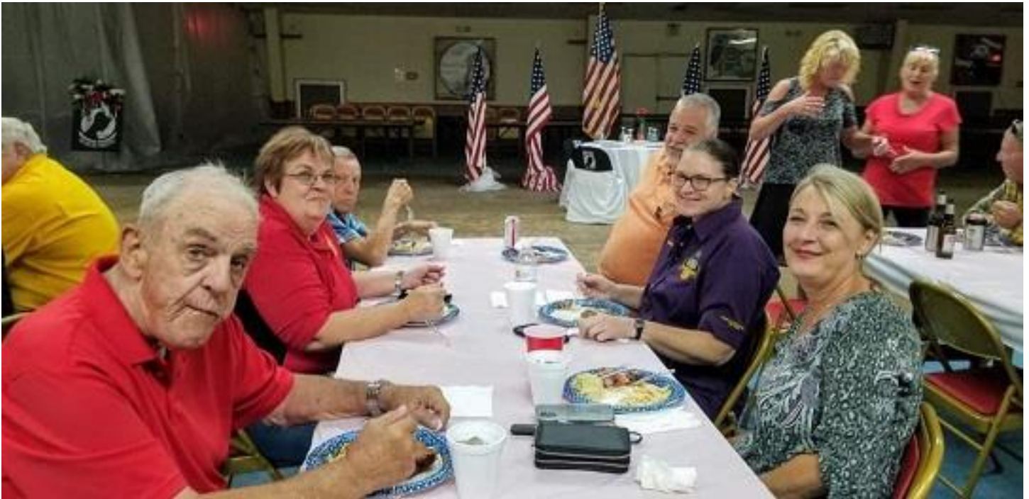
Above: Members enjoying a meal after the ceremony;