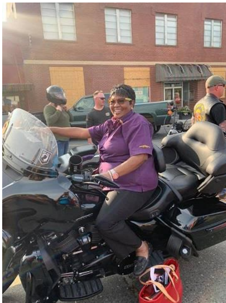
State Auxiliary President