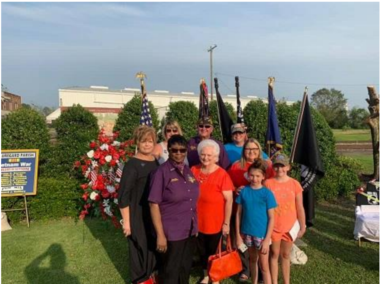
Below: Auxiliary Members from State down to Post Level supporting the event