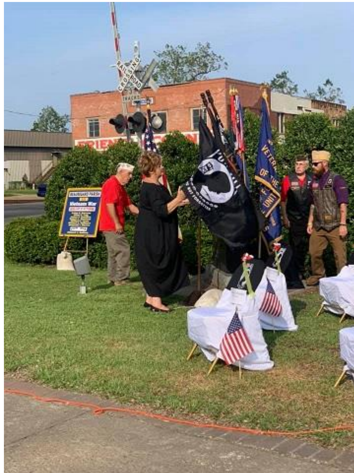
Setup and waiting for ceremony