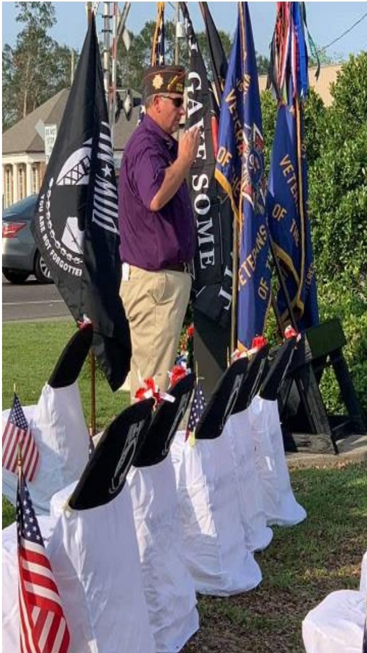
Proud to have a State Commander at the Ceremony and Participate