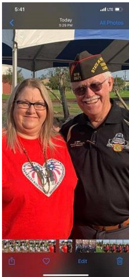
State Junior Vices Commander and President